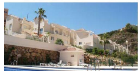
RESIDENCIAL LA ATALAYA