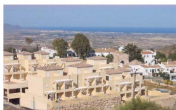
RESIDENCIAL LA FUENTE VILLAS ADOSADAS CON GARAJE, ZONAS COMUNES Y PISCINA COMUNITARIA DE LA FUENTE MONTAÑAS DE BEDAR, S.L.