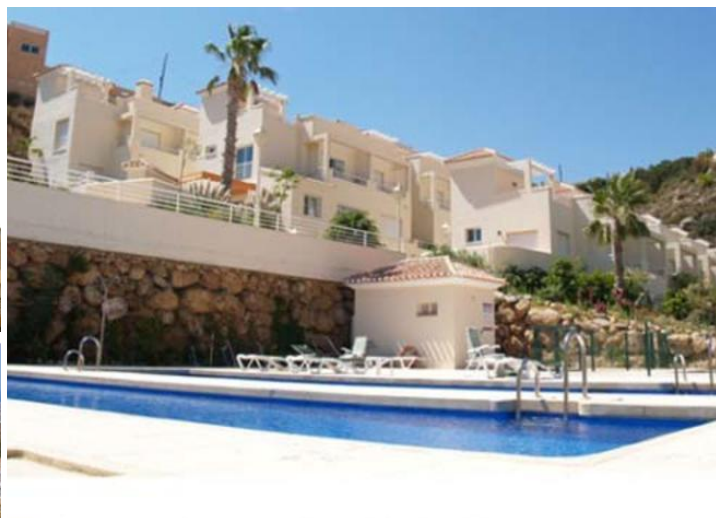
RESIDENCIAL LA ATALAYA VILLAS ADOSADAS CON GARAJES, ZONAS COMUNES Y PISCINA COMUNITARIA DE LA FUENTE MONTAÑAS DE BEDAR, S.L.