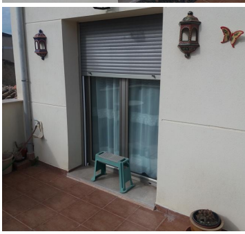
Modern 2 bed, 1 bath, furnished apartment, with large terrace, on the rambla front of Arboleas village, and key ready.

PRICE REDUCED TO 97,950€ AS THIS ONE NEEDS TO BE SOLD QUICKLY.